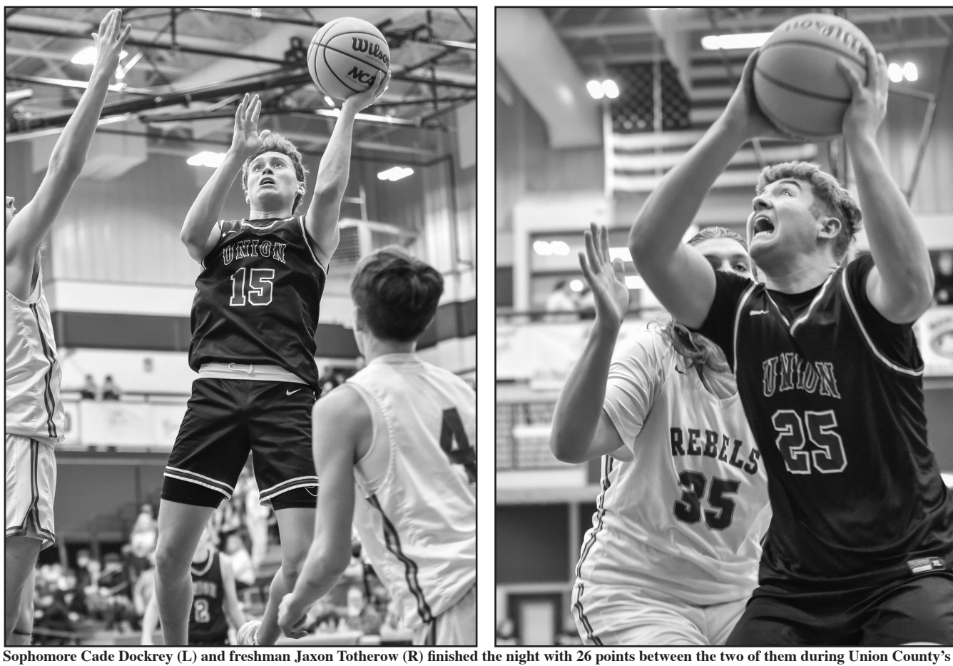
59-48 victory at Fannin County.