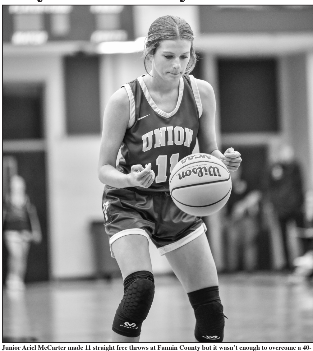
18 halftime deficit.